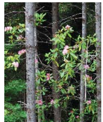
These images have been provided by individuals working with the project partners